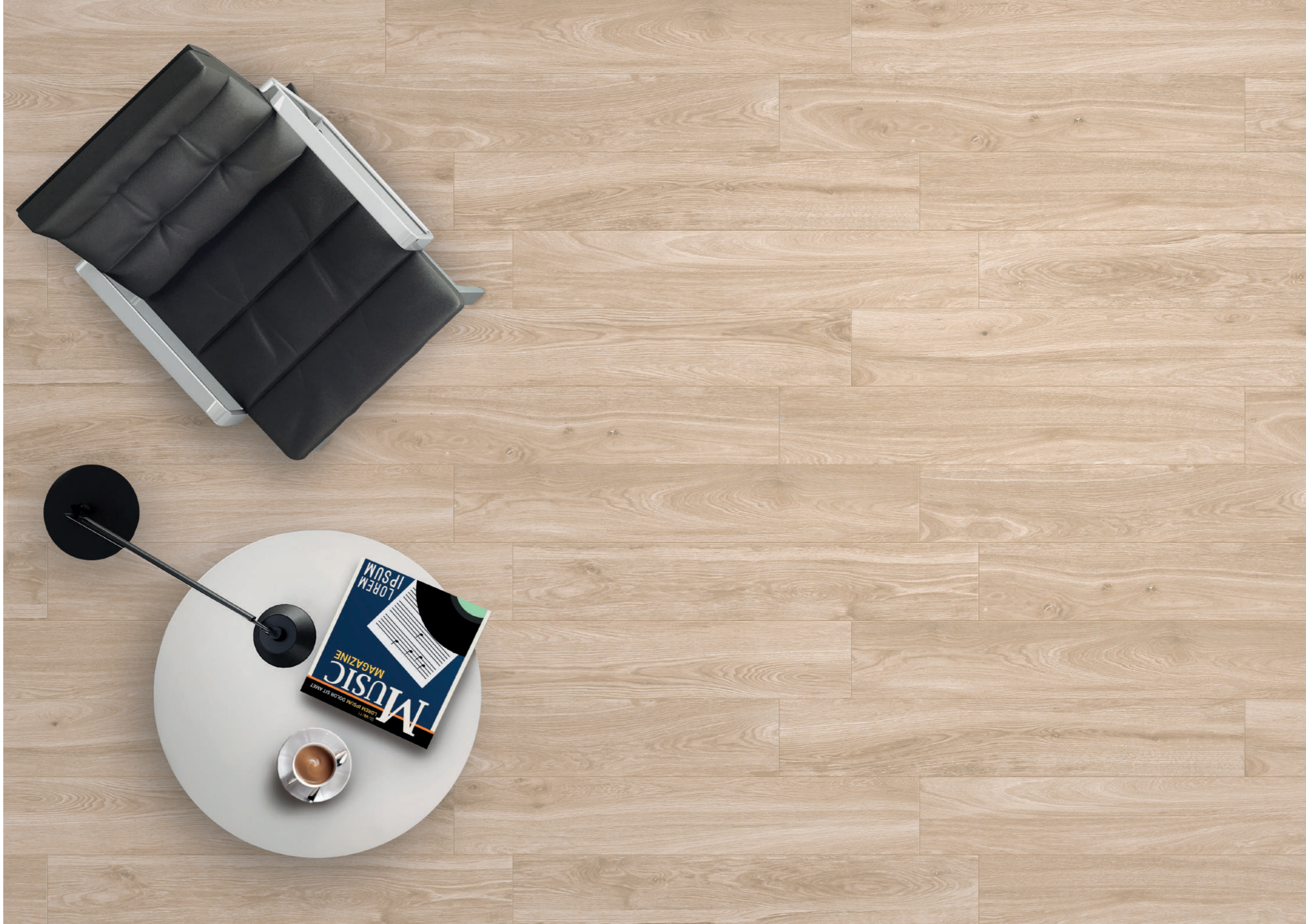
FUJI PURE 20X120 RETT. (7 7/8 "x47 1/4 ")