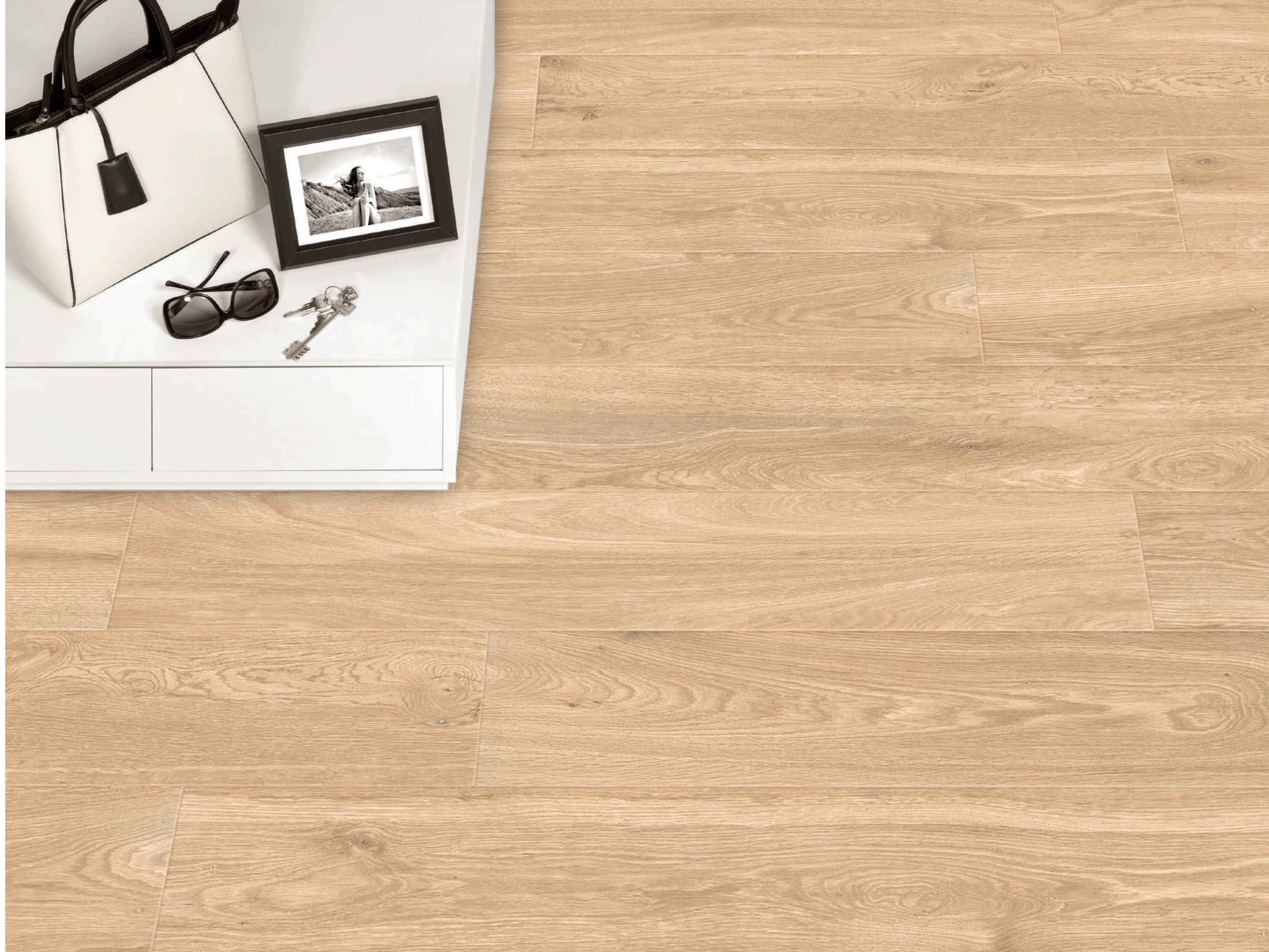
FUJI NATURAL 20X120 RETT. (7 7/8 "x47 1/4 " )