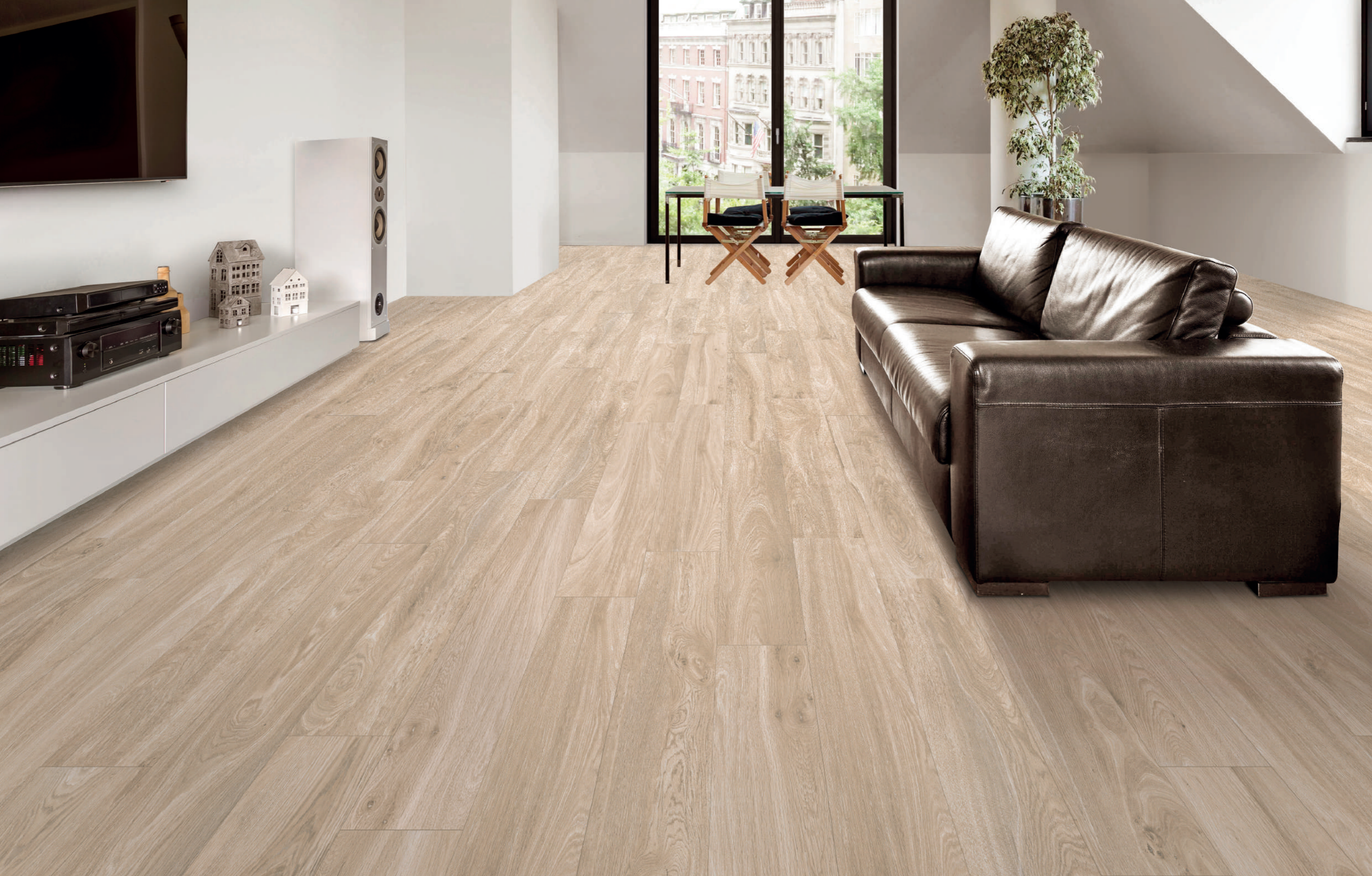
FUJI PURE 20X120 RETT. (7 7/8 " x 47 1/4 " )