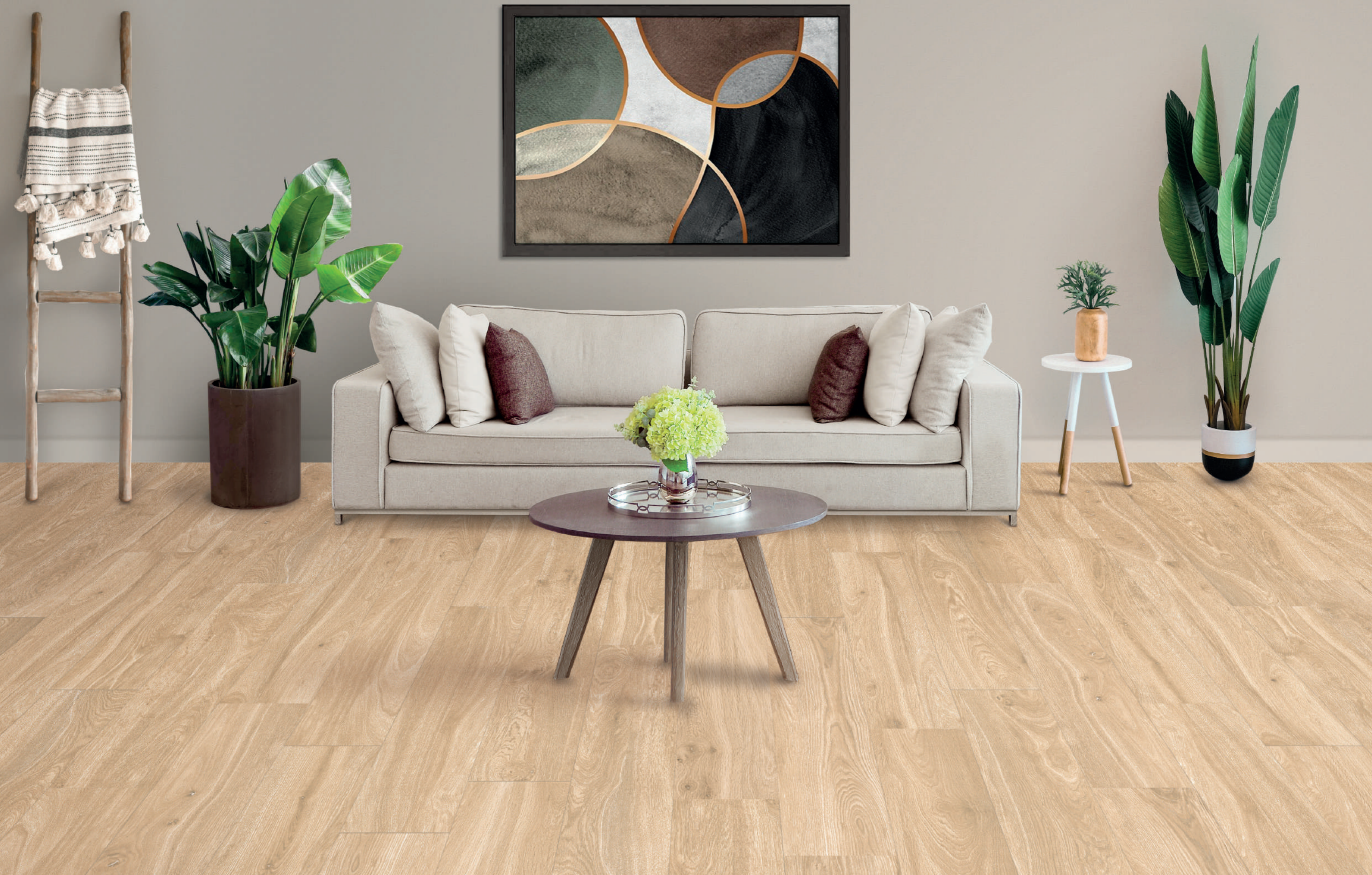
FUJI NATURAL 20X120 RETT. (7 7/8 "x47 1/4 ")