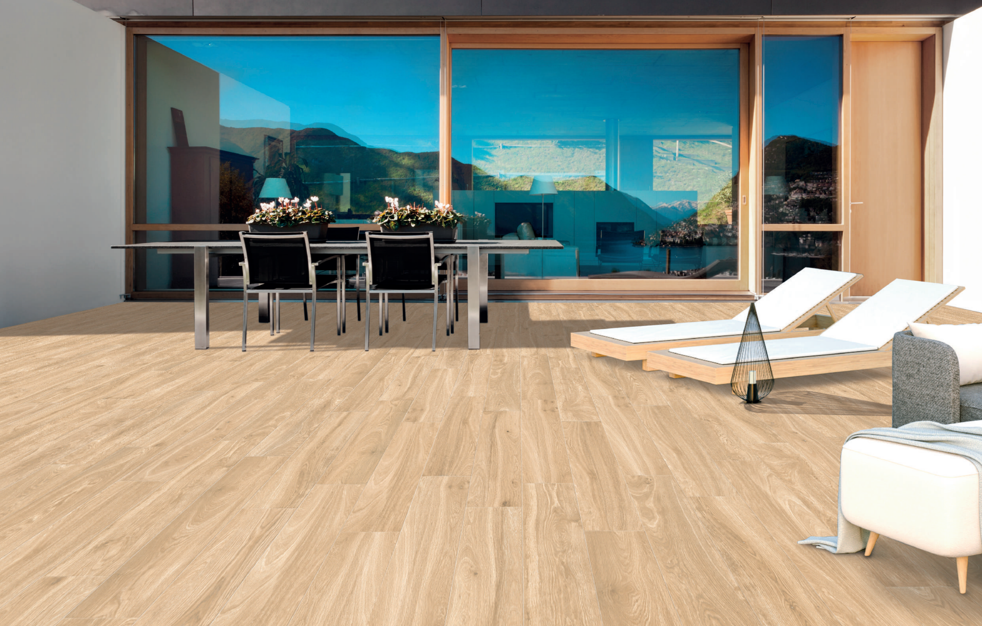
FUJI NATURAL GRIP 20X120 RETT. (7 7/8 "x47 1/4 ")