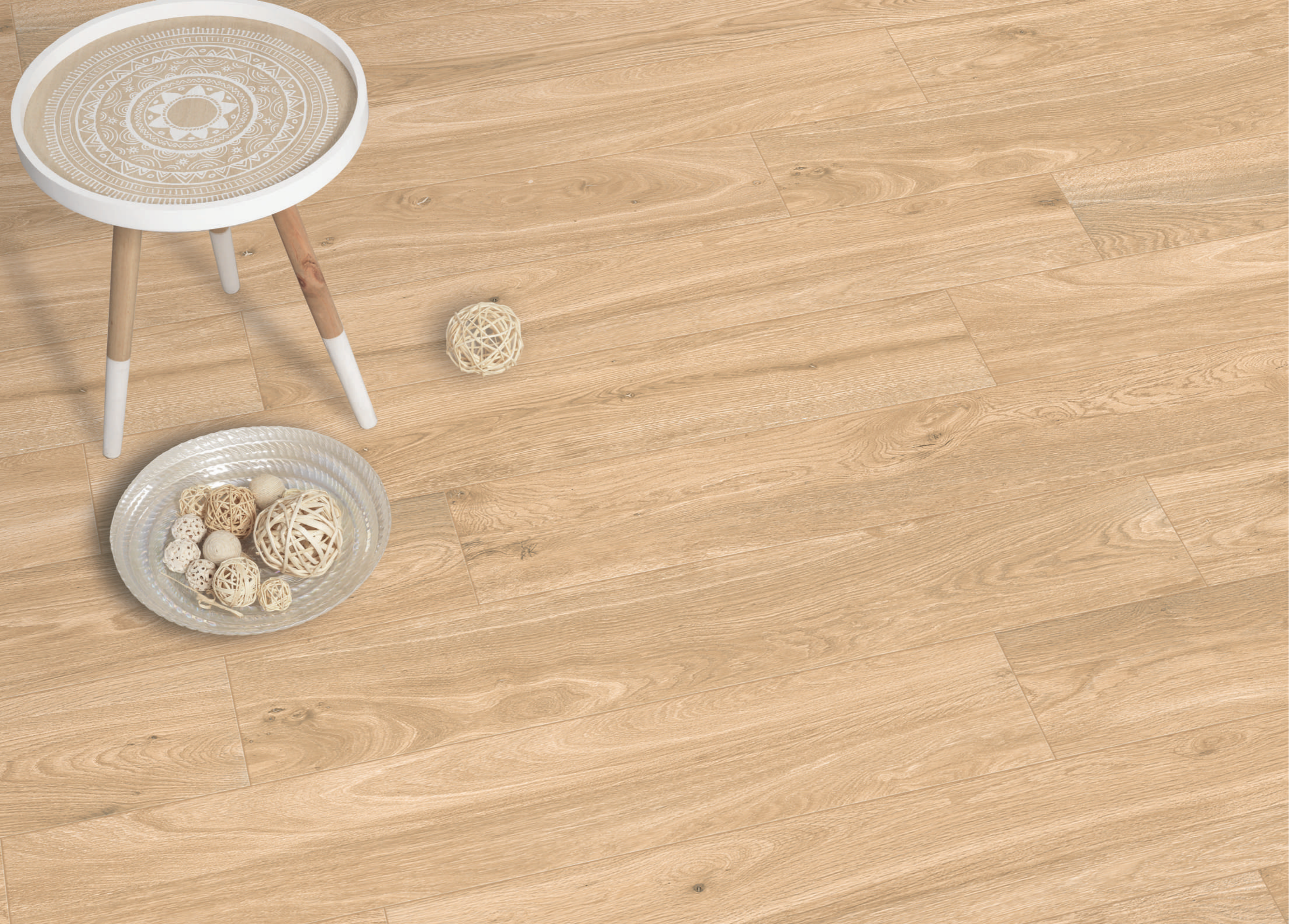
FUJI NATURAL 20X120 RETT. (7 7/8 "x47 1/4 " )