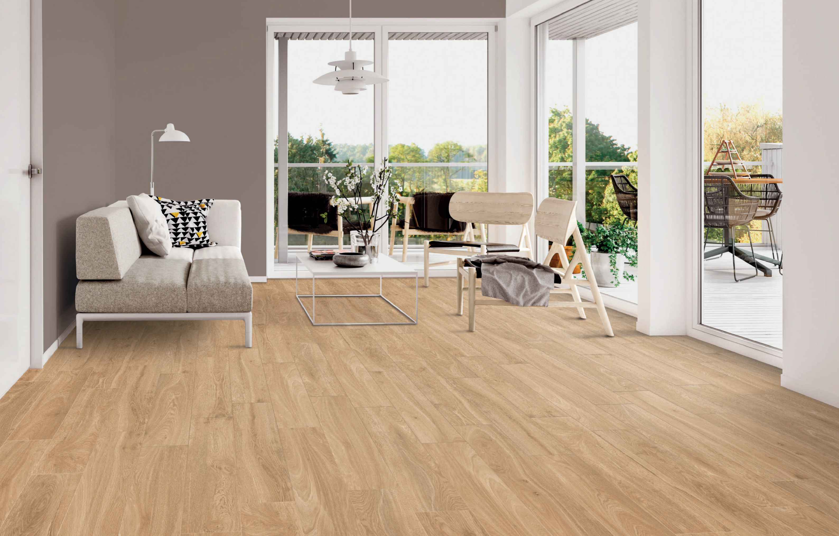
FUJI MIELE 20X120 RETT. (7 7 / 8 "x47 1 / 4 ")