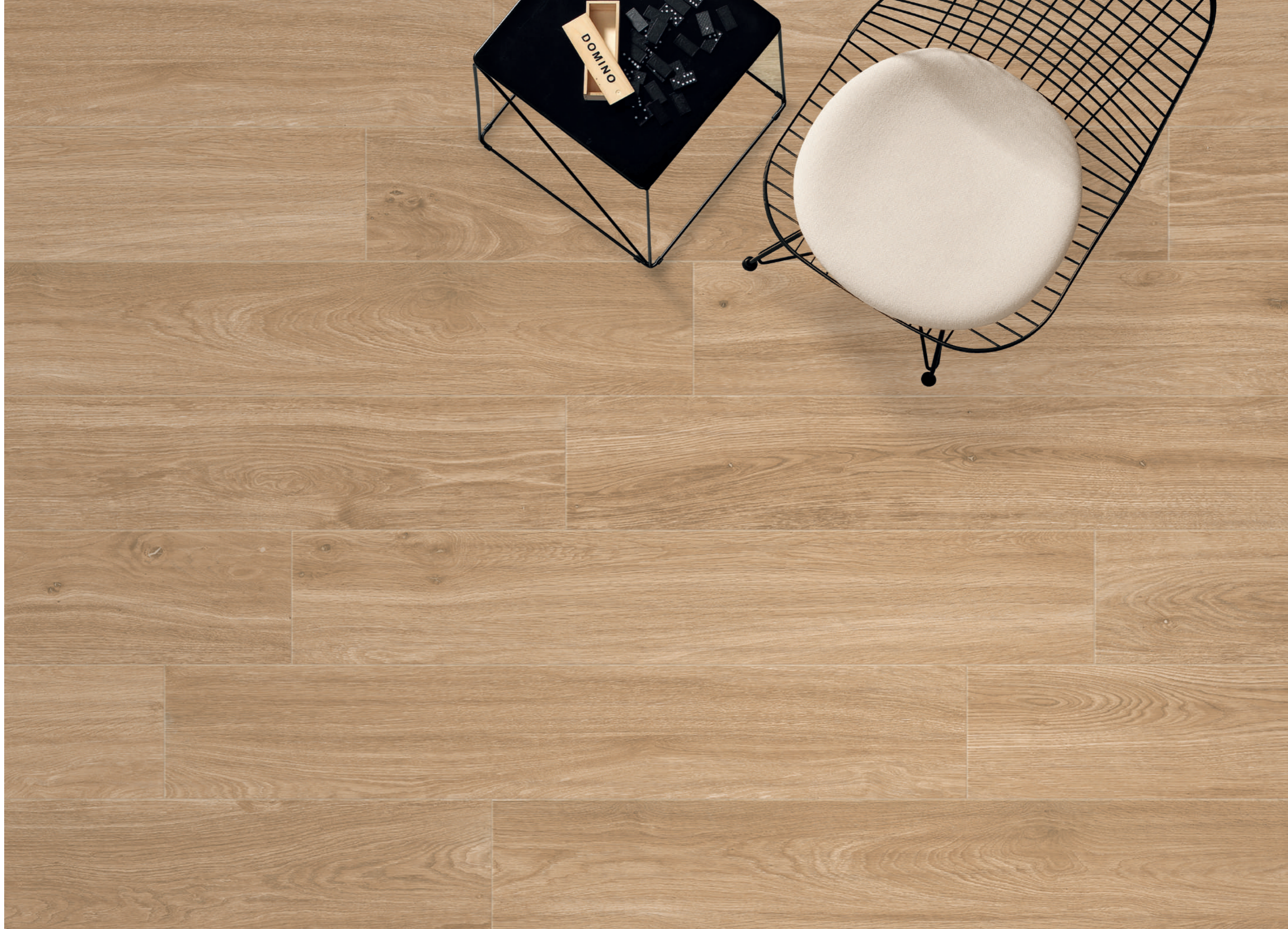
FUJI MIELE 20X120 RETT. (7 7 / 8 "x47 1 / 4 ")